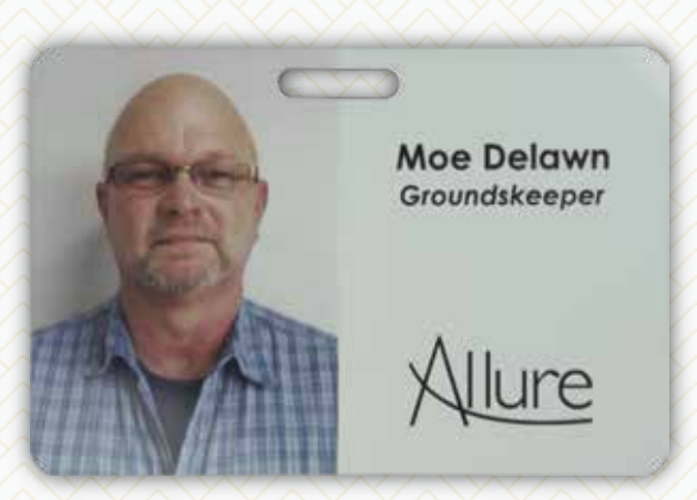
FC-100P - Digitally Printed Photo ID Mono White Material Slot Punch