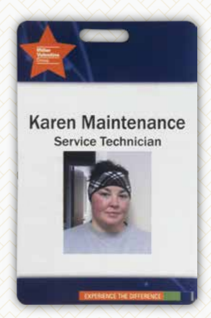
FC-100P - Digitally Printed Photo ID Mono White Material • Slot Punch

With our photo ID badges, there'll be NO MISTAKING WHO YOU ARE . We print your picture and personalization onto a durable plastic card. Perfect for years of use.