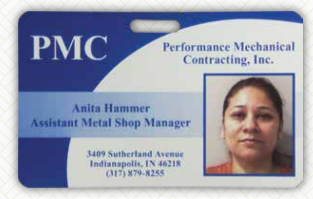
FC-100P - Digitally Printed Photo ID Mono White Material • Slot Punch